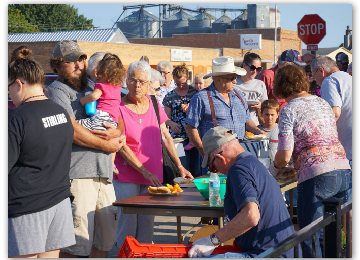
The TACF funds many community gatherings including a community movie night and dinner.