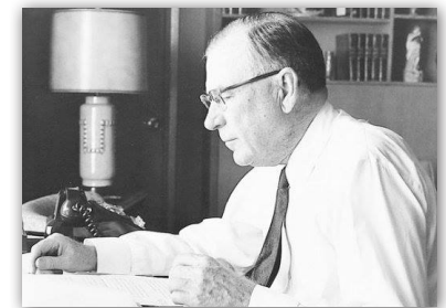
William McKnight, founder of the McKnight Foundation