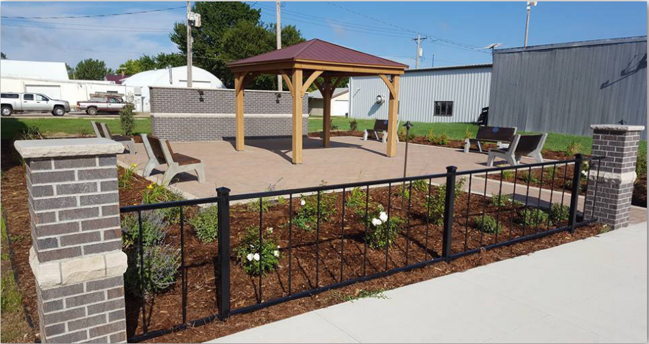
The TACF supported the creation of this park on main street that since has been utilized for many community gatherings.