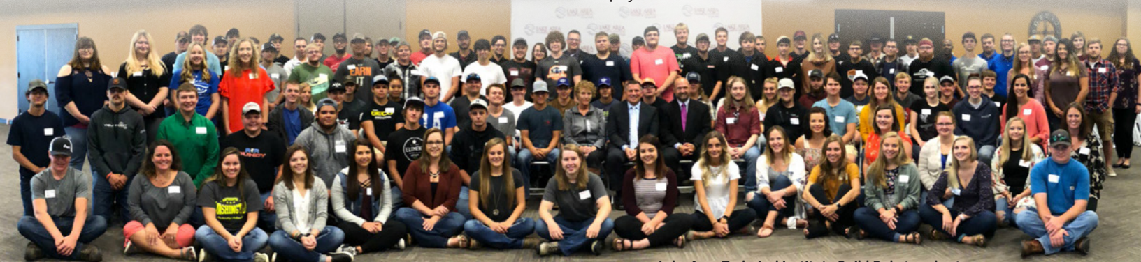
Lake Area Technical Institute Build Dakota cohorts