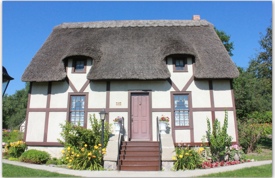
Wessington Springs is known for the Hathaway cottage and Shakespeare Garden. The WSACF has supported the cottage and garden through grants in the past.

“Smaller cities such as Wessington Springs have many useful organizations desiring to perform supportive functions throughout the area,” said WSACF member Dale Schimke. “However, often times a lack of funds stands in the way. The community foundation is an avenue to provide these needed funds for the benefit of many.”