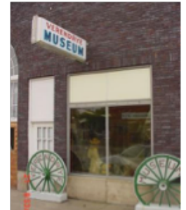
Verendrye Museum, Fort Pierre