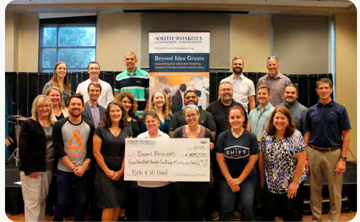
▲ SDCF presented awards to seven nonprofits in Sioux Falls, including five BIG 2023 Round 1 recipients.