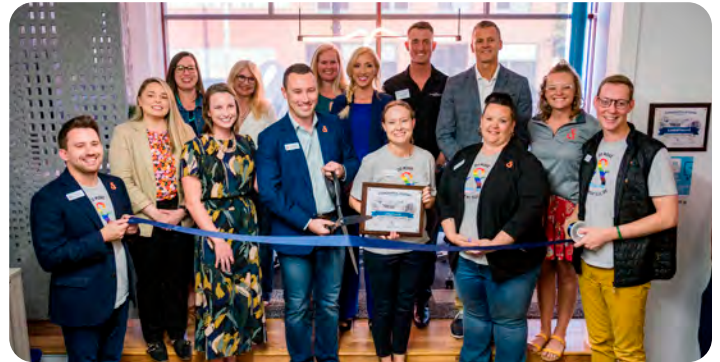
▲ Lost&Found staff and members of the Sioux Falls Chamber of Commerce

Lost&Found seeks to end suicide and has worked collaboratively with higher education institutions across the state to tailor data-driven prevention initiatives at each campus. In addition to internal practices that promote leadership and innovation internally, Lost&Found has made an impact through their collaborative efforts across South Dakota.