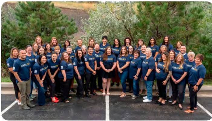
▲ Black Hills Special Services Cooperative staff

In celebration of nonprofit organizations driving innovative and impactful community work across the state, SDCF is proud to recognize Black Hills Special Services Cooperative (BHSSC) and Lost&Found with the 2023 Bush Prize: South Dakota.